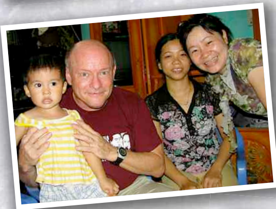
More recovering Vietnamese kids after orthopaedic surgery paid for with your donations

Living in a small town in Vietnam, this family was in crisis when I met them. The father died last year, the mother is going blind and the 18 month old boy seriously needs major heart surgery costing $3,200 or he'll die by the end of August. An Australian company paid for the surgery so 100 Friends funds were used to help the family start a small business. The mother will get her eyes looked at my eye doctor in Hanoi - all paid for by the project.