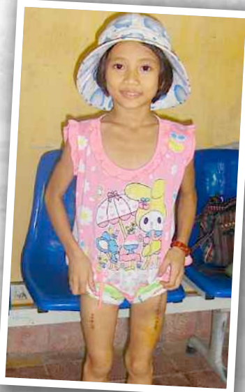
A young Vietnamese girl after surgery for treating muscular fibrosis. 100 Friends donations made it possible.