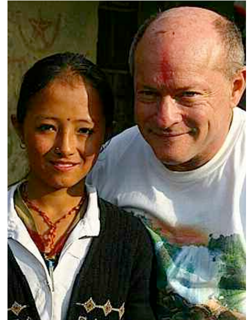
One of the young girls we are protecting in our Nepalese School Program (read more inside)